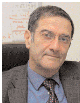
Prof. Serge Haroche