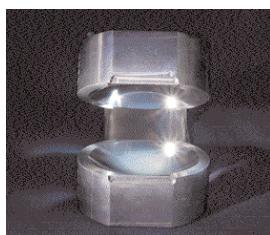
The photon box

This is precisely what we have achieved recently, by implementing a QND method that we had proposed back in 1990. We have been able to observe hundreds of times the same photon trapped in a box. After a perceptible delay which can reach half a second, the light particle finally disappears, in a sudden process occurring at a random time. We have witnessed in this way the story of single photons and recorded the times of their birth and death. This experiment, whose results have recently been published in Nature , has required two conditions that were not fulfilled at the time of our early proposal. We had to trap light in a box for a tenth of a second on average, in order to have the time to perform repeated observations. We had also to develop a new kind of atomic detector able to record the imprint of a single photon without absorbing its energy. It has taken us several years of strenuous efforts to meet these challenges.