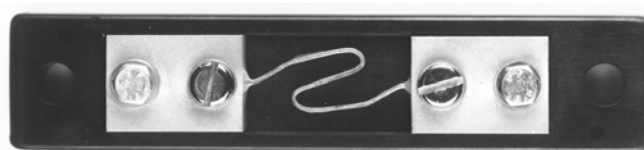
Shunts 1...25 A