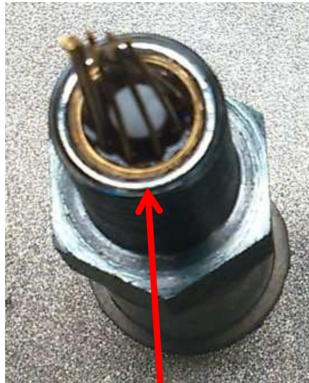
The welding line is a circular path sealing the Header and the Steel case.